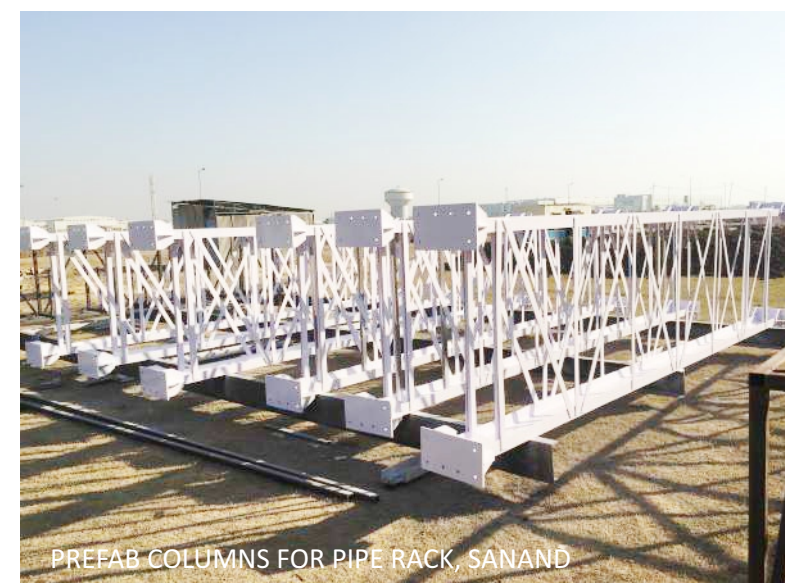
PREFAB COLUMNS FOR PIPE RACK, SANAND

Strength and durability are qualities that are naturally associated with steel; the same can be said of Maxell Services. We have become the single source structural steel fabrication and construction firm of choice by providing a dynamic full range of engineering, fabrication and erection services. Our complete in house capabilities successfully enable fast response, maximum flexibility and complete coordination of all phases of any project. Maxell Services' clients are assured of a more profitable venture because our comprehensive array of services provides well managed projects, with better quality, predictability, and cost efficiency.