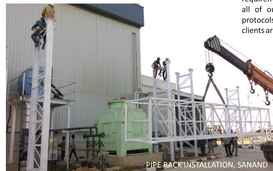
PIPE RACK INSTALLATION, SANAND