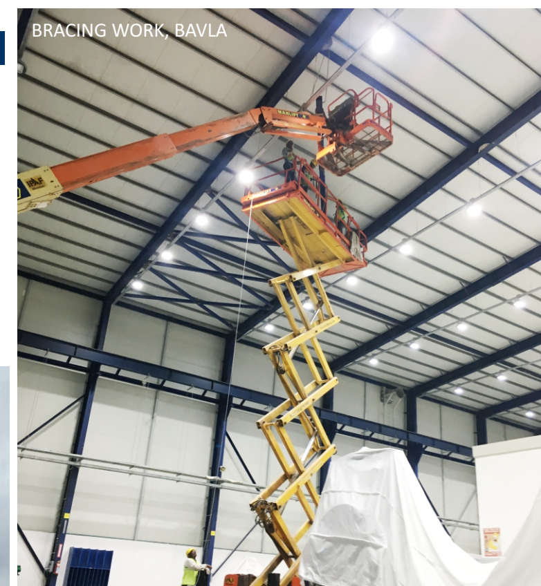
BRACING WORK, BAVLA