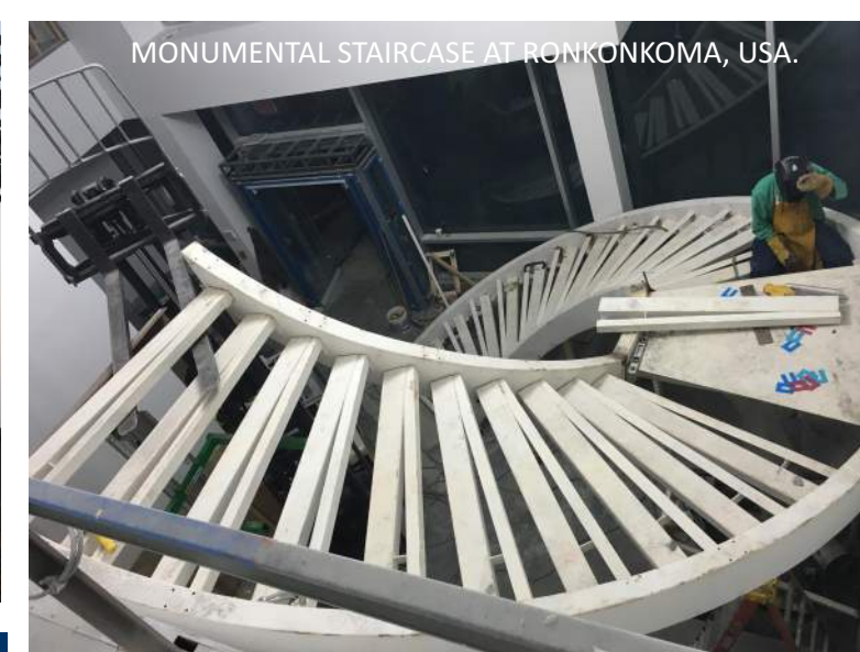
MONUMENTAL STAIRCASE AT RONKONKOMA, USA.