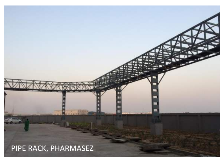
PIPE RACK, PHARMASEZ