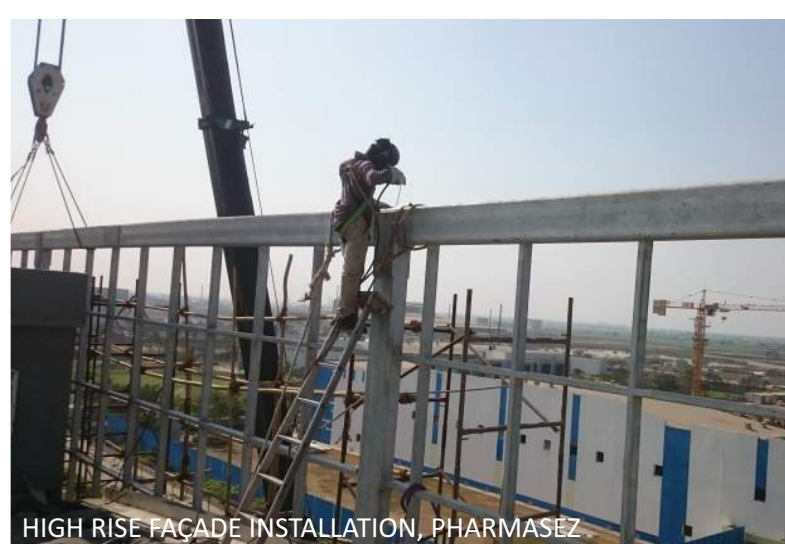
HIGH RISE FAÇADE INSTALLATION, PHARMASEZ