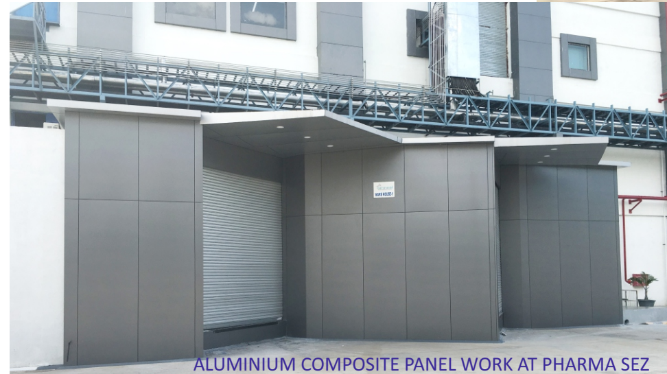
ALUMINIUM COMPOSITE PANEL WORK AT PHARMA SEZ