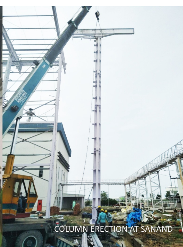
COLUMN ERECTION AT SANAND