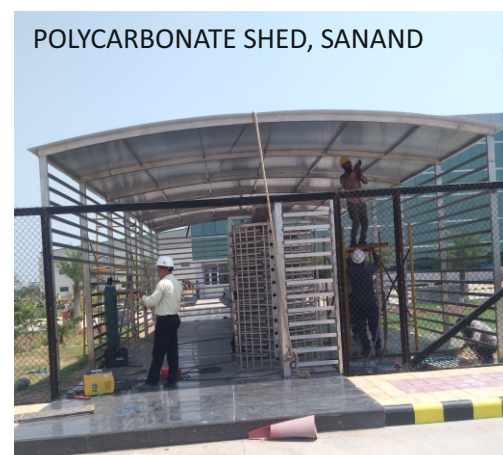
POLYCARBONATE SHED, SANAND