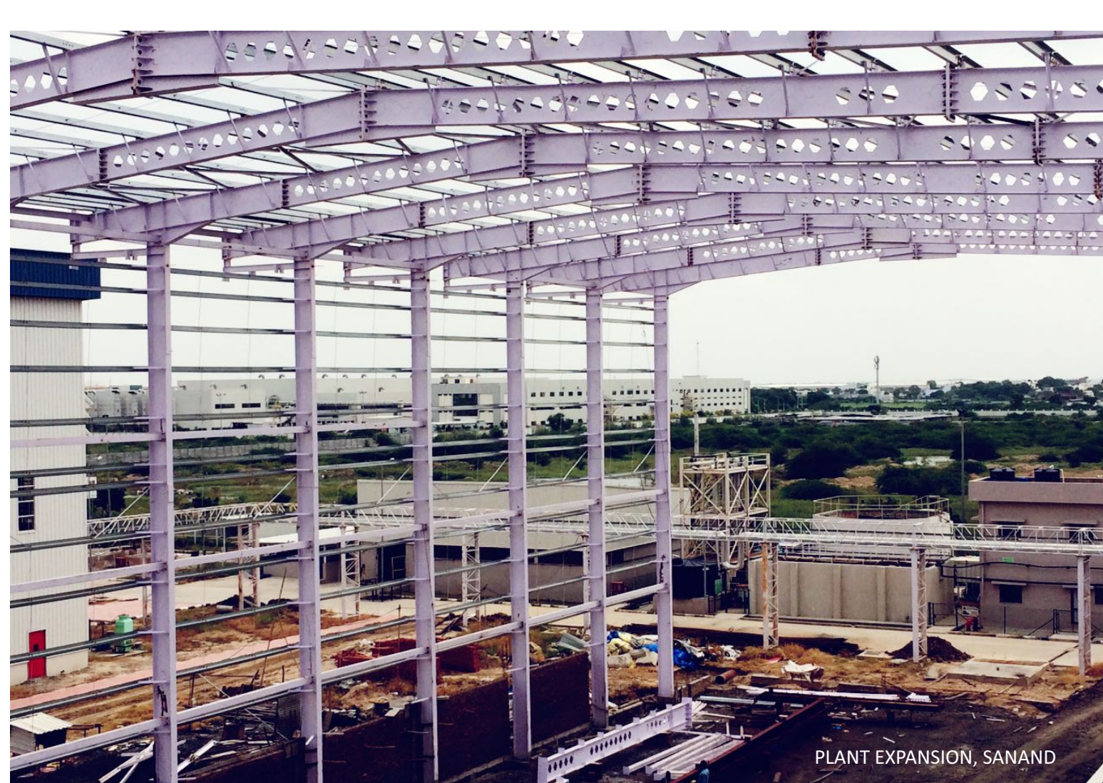
PLANT EXPANSION, SANAND