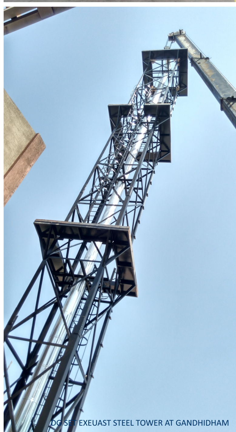
DG SET EXHAUST STEEL TOWER AT GANDHIDHAM