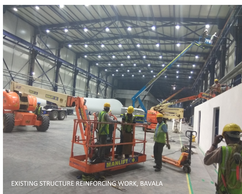
EXISTING STRUCTURE REINFORCING WORK, BAVALA