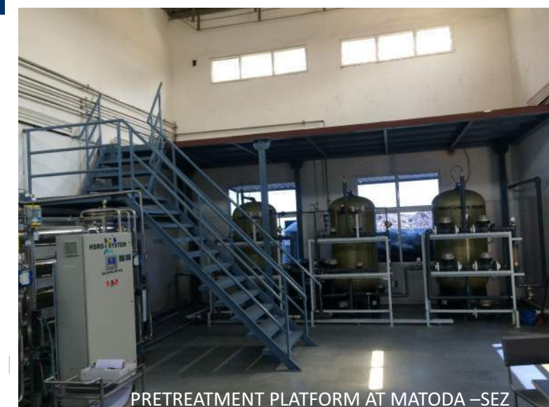
PRETREATMENT PLATFORM AT MATODA –SEZ