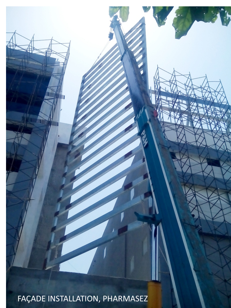
FAÇADE INSTALLATION, PHARMASEZ