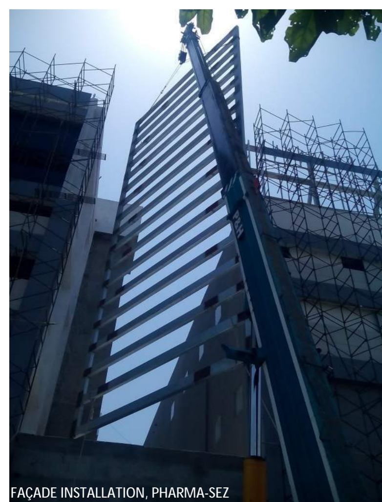
FAÇADE INSTALLATION, PHARMA-SEZ