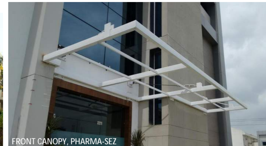
FRONT CANOPY, PHARMA-SEZ