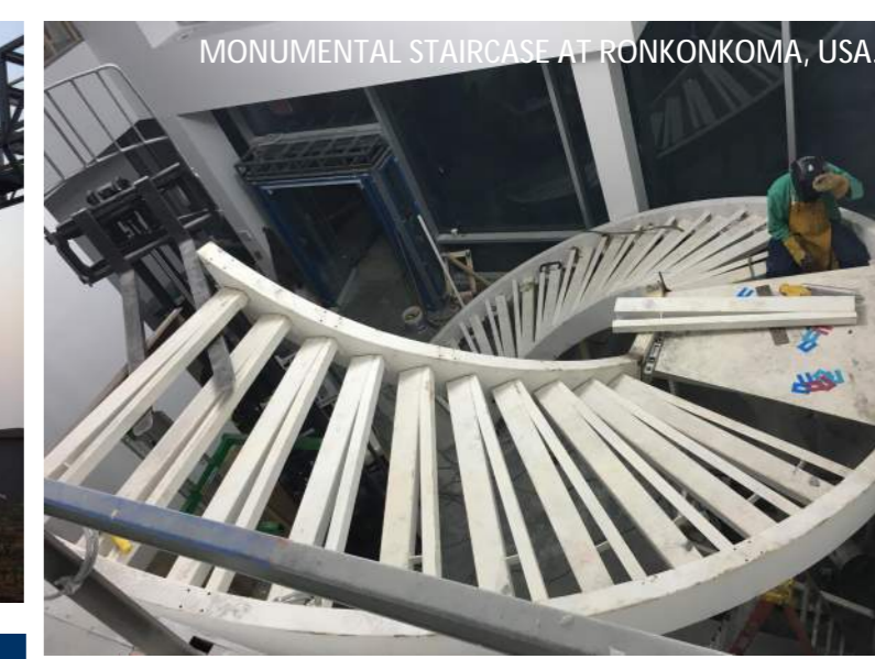
MONUMENTAL STAIRCASE AT RONKONKOMA, USA.

Strength and durability are qualities that are naturally associated with steel; the same can be said of Maxell Services. We have become the single-source structural steel fabrication and construction firm of choice by providing a dynamic full range of engineering, fabrication and erection services. Our complete in-house capabilities successfully enable fast response, maximum flexibility and complete coordination of all phases of any project. Maxell Services' clients are assured of a more profitable venture because our comprehensive array of services provides well-managed projects, with better quality, predictability, and cost efficiency.