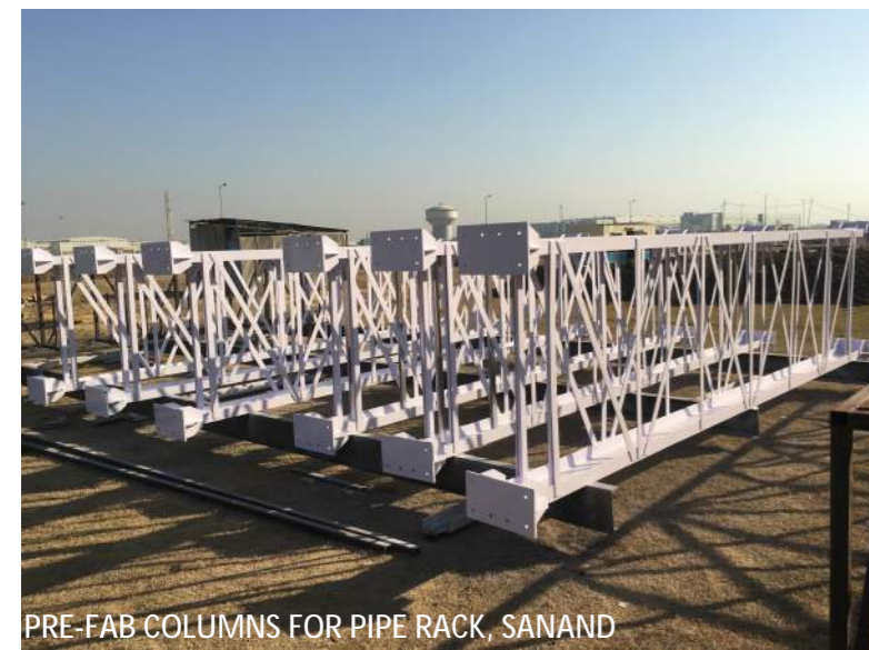
PRE-FAB COLUMNS FOR PIPE RACK, SANAND

Our projects are supervised by experienced project engineers, who are responsible for the delivery of projects to predefined quality standards and time duration. Our approach and processes are different for each client and fit into their requirements, processes and the agreed work-flows. However, all of our expertise, experience, systems, processes and protocols are used to build a process and system that our clients are comfortable with.