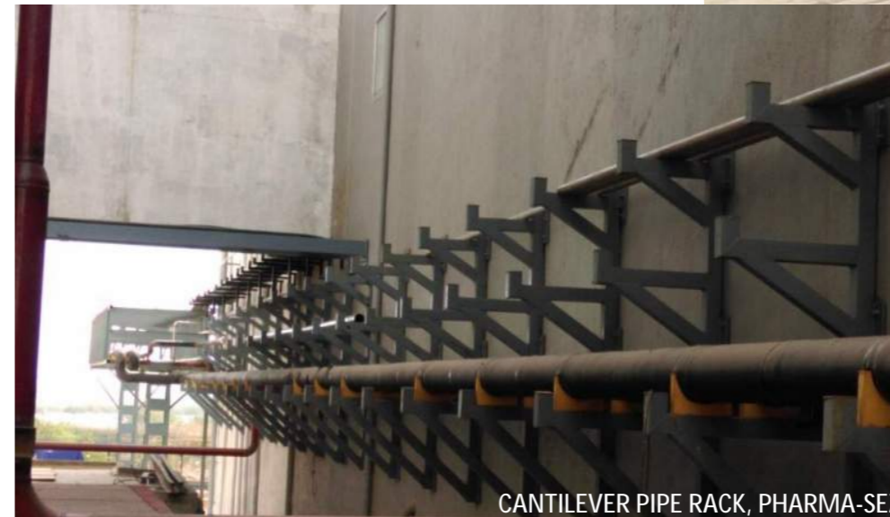
CANTILEVER PIPE RACK, PHARMA-SEZ