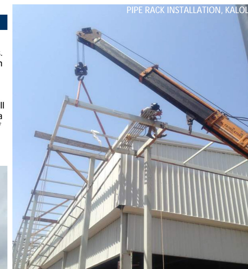
PIPE RACK INSTALLATION, KALOL