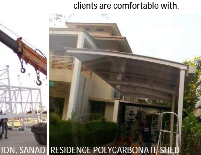
RESIDENCE POLYCARBONATE SHED