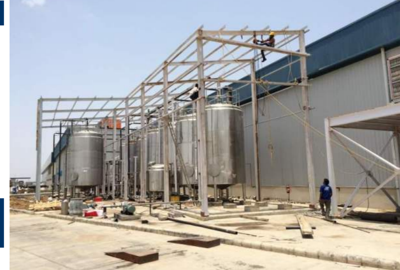
STRUCTURE FOR TANK SHED, SANAND

Our clients have been able to rely upon us to meet the exacting standards and requirements of their projects regardless of scope, size or complexity. We ensure that the confidence placed in us as their fabricator of choice is justified by always rendering up that rare commodity, a cost-effective quality project, delivered on time and within budget. You will find Maxell Services to be the most innovative, responsive and customer focused organization in the industry.