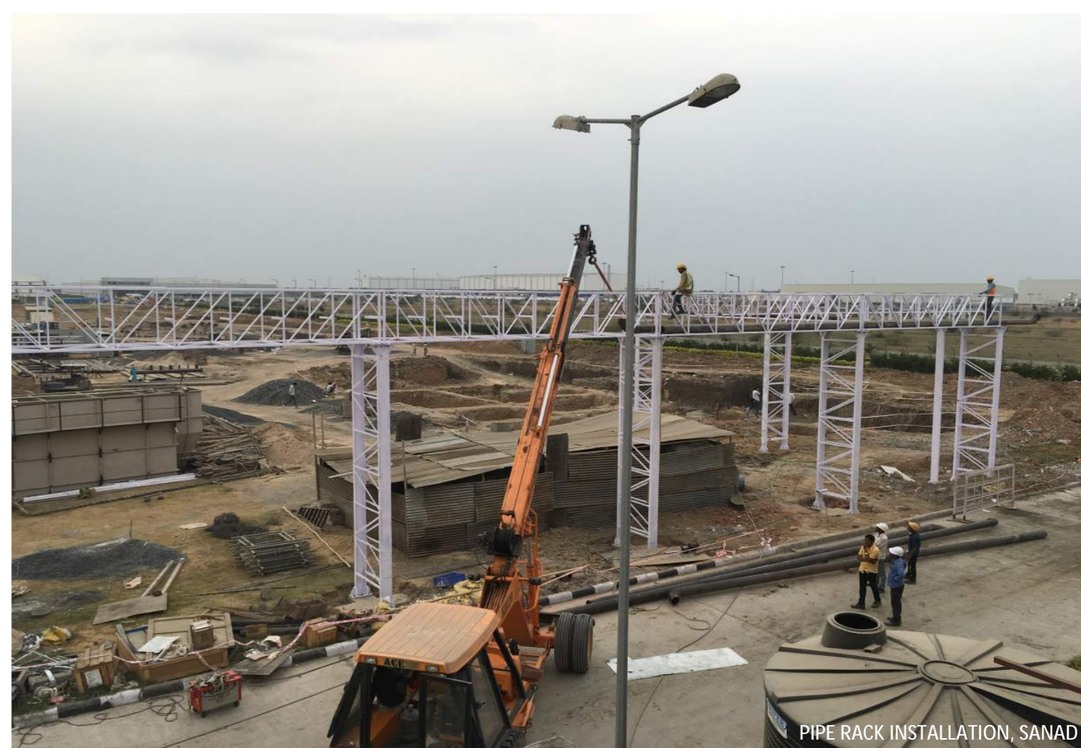
PIPE RACK INSTALLATION, SANAD