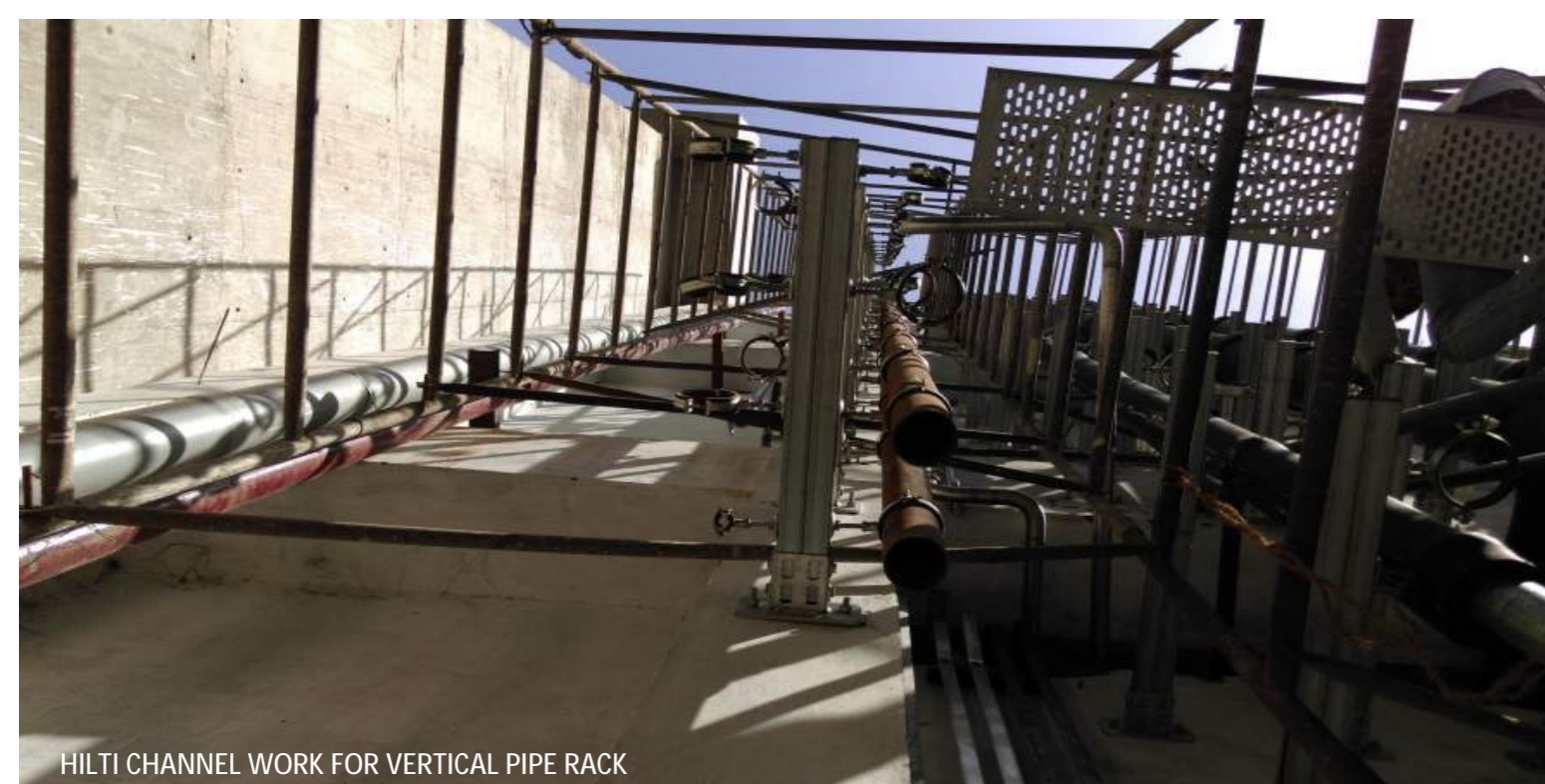
HILTI CHANNEL WORK FOR VERTICAL PIPE RACK