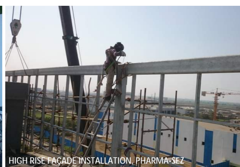
HIGH RISE FAÇADE INSTALLATION, PHARMA-SEZ