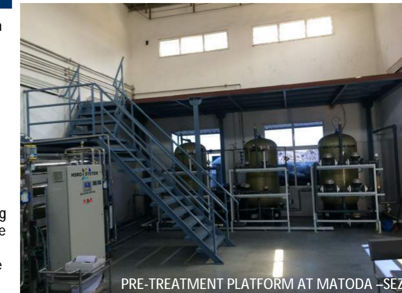
PRE-TREATMENT PLATFORM AT MATODA -SEZ