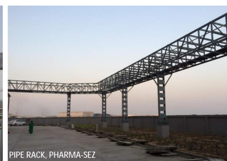
PIPE RACK, PHARMA-SEZ